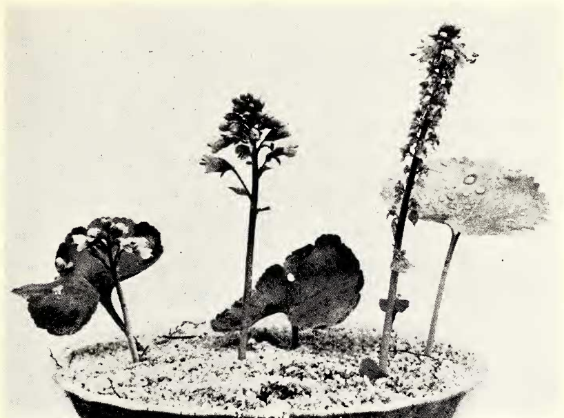
FIG. 3. Inflorescences and single basal leaves of S. reniformis (left), hybrid (center), and S. missurica (right).

more natural to retain species of Besseya in Synthyris —as was done up to the time of Rydberg (1903).